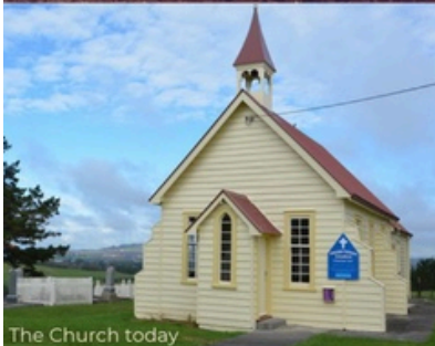
The Church today